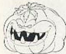
Tomacho - Bloated yet slow, defeat him to enter into the dark dank world of San Zucchini's sewers.

Most of the Gang of Six are to be avoided, as opposed to being stomped on by Chad. Learn their modes of attack in order to get past them, thereby defeating them!