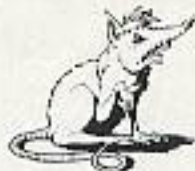
Tomato Rats - Swim the sewers looking for fresh meat.