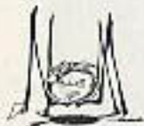
Tomato Spiders - Quick-footed monsters.